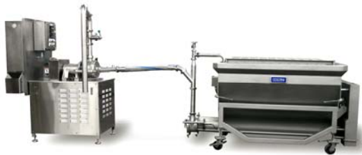
AR901MC system shown with screw loader

PrimeCut™ COZZINI EMULSION/REDUCTION SYSTEMS