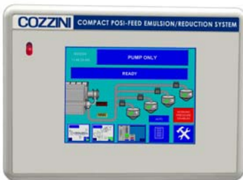
Touch screen display